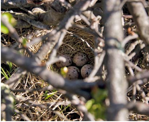
136 Nest of Pallas's Reed Bunting / Pallas' Rietgors Emberiza pallasii , Rachmanovskiy lake, East Kazakhstan province, Kazakhstan, 3 July 2013 (Thijs P M Fijen)

Thijs Fijen in litt). This is the second breeding record in Aqmola province.