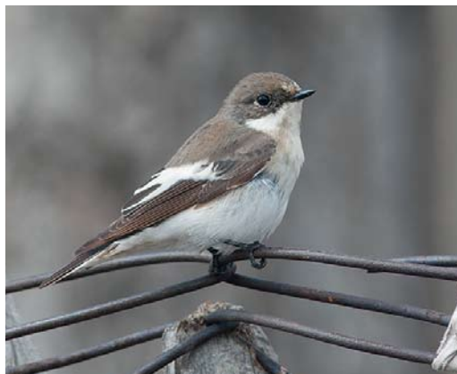
135 Pied Flycatcher / Bonte Vliegenvanger Ficedula hypoleuca , second calendar-year male, Maishukur, Aqmola province, Kazakhstan, 30 April 2013 (Arend Wassink)

On 19 January 2014, one was photographed at