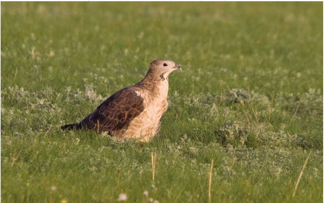
134 Crested Honey Buzzard / Aziatische Wespendif Pernis ptilorhynchus , adult male, Korgalzhyn, Aqmola province, Kazakhstan, 16 May 2013 ( Thijs P M Fijen )