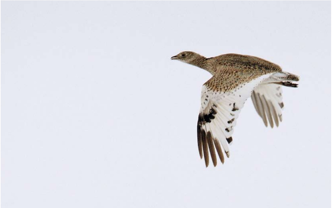
133 Little Bustard / Kleine Trap Tetrax tetrax , first calendar-year, Sorbulak lake, Almaty province, Kazakhstan, 21 November 2012